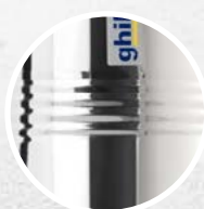
Stainless steel container sturdy and durable