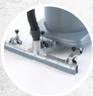
Gangway tool (optional)