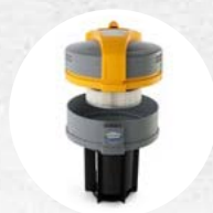
Ultra FilteRing System