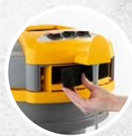
Exhaust air filter