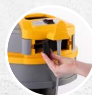
Exhaust air filter