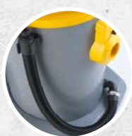
Drain hose to empty the container from liquids (PD).