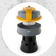
Ultra FilteRing System