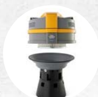
Ultra FilteRing System