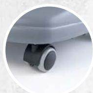
Front swivel castor wheels