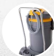
Trolley with handle