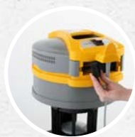
Inlet and outlet of the motor cooling air