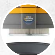
PTFE cartridge filter M filtration class