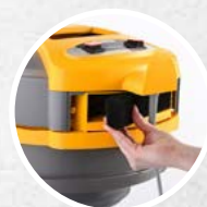
Exhaust air filter