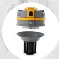
Ultra FilteRing System