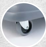
Front swivel castor wheels